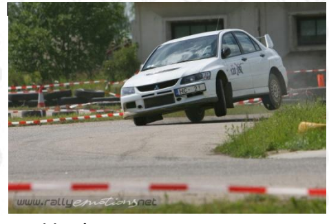
Provisional program Sunday, August 26 – Registration and reconnaissance(8:00 – 11:00) –Competition(11:00 – 18:00) –Award ceremony

Liepaja Milk Factory track will be transformed in approximately 1 km long asphalt lap, where the competition will take place. It will be special trial for participants, because in other cup contests there are gravel tracks as well, moreover, those tracks are not bounded with sidewalk