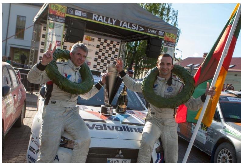
Champions' Challenge Cup winners 2014