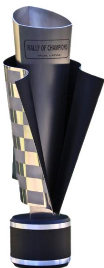
Champions' Challenge Cup

Since 2009 Rally Talsi bears a name of Rally of Champions and hosts a fierce competition for the Champions' Challenge Cup . The goal of the competition is to provide equal conditions for the N4 group champions of the previous rally season and sort it out, who is the fastest of them all. Rally of Champions has seen champions from the Baltics, Scandinavia, Belarus, Great Britain, Russia, Slovakia, and even from Kuwait. Moreover, Rally of Champions has seen competitors, who are now competing for the title of the World Rally Championship – Norwegians Andreas Mikkelsen ( Volkswagen Motorsport ) and Mads Østberg ( Citroën Total Abu Dhabi World Rally Team ). Who will outcompete others to bring home the glory and for a year also Champions' Challenge Cup ?